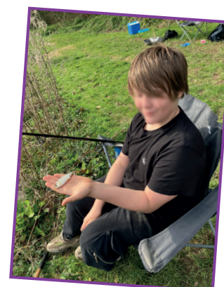
Pupils showing the fish they have caught