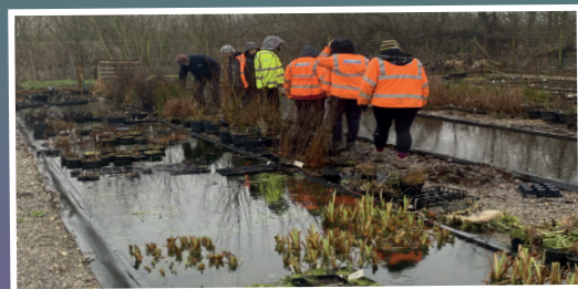
Pupils restoring the pond at Constable Street Allotments

The pupils were involved in completing a conservation task at Constable Street Allotments, they restored a pond for frogs ready to be lined with pond liner; the frogs enjoyed the new habitat and the extra space.