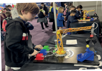
Pupils engaging during the STEM activities

Year 7 pupils visited Magna for the “Get up to Speed with STEM” event. This experience helped link their learning to real-life applications and provided valuable insight into the wide range of opportunities and career pathways available within STEM.