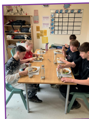
Pupils enjoying home cooked meal together

It's been wonderful to see so many smiles and hear plenty of laughter. These experiences have not only been enjoyable but have also helped pupils build confidence, try new things, and simply have a great time together.