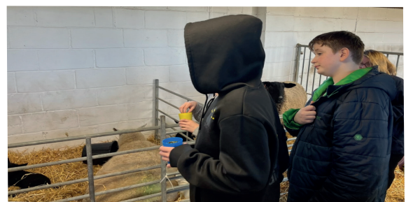
Lambs had been born on the morning of our visit to the farm!

Through these experiences, pupils are actively engaging in their learning while developing their understanding of local history and geography. They are also benefiting from opportunities to spend time outdoors, exploring and enjoying a diverse range of environments.