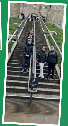
Pupils on the steps leading up to Clifford's Tower