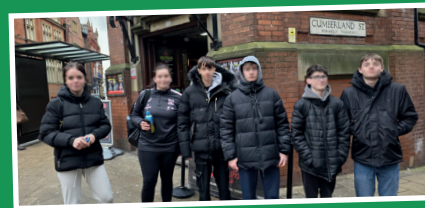
Pupils outside of York Dungeons

This valuable experience has prepared them well as they continue working towards their Entry Level certificates and GCSEs—keep up the excellent work!