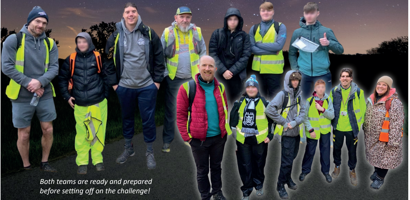
Both teams are ready and prepared before setting off on the challenge!